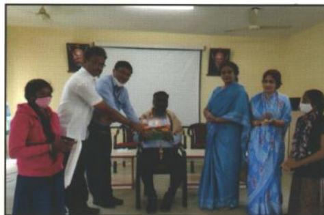
English Department Seminar