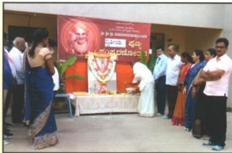
Punya Smarana Programme