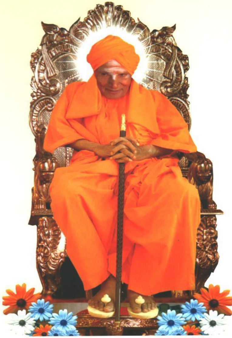
Karnataka Rathna, Kayaka Yogi His Holiness

Dr. Sree Sree Shivakumara Swamigalu Founder, Sree Siddaganga Education Society (R)