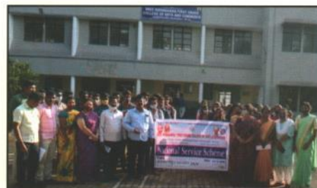
Indian Redcross Unit